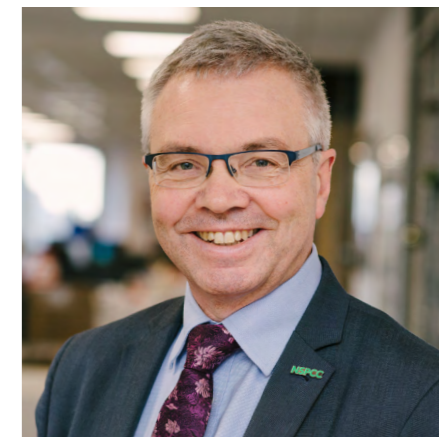
Peter Wanless Chief Executive of the NSPCC

“ If we all come together now, we can make a difference. We have an important responsibility as the NSPCC to rally people together and make the biggest impact we can to stop child abuse and neglect. ”